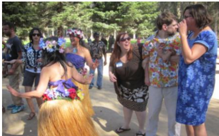
Staff and residents get their hula on.